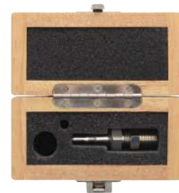
Master Leak Wood Box