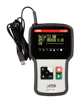
TLC 600 Remote control