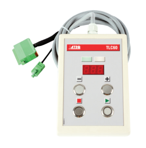
TLC 60 Remote control